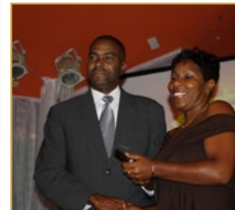
Natmed receives gold award for Product and Customer Service Quality