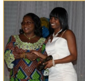
St. Lucia Distillers accept Diamond award