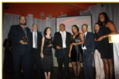
Du Boulay's Bottling Company crew with awards