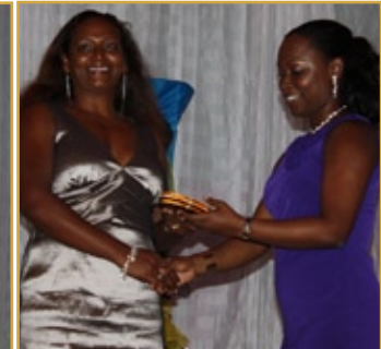
Forest Springs receive Gold award for Implementation of Standards and Best Practices