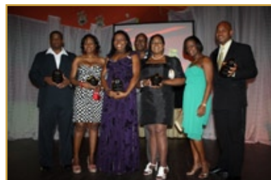
Staff of Harris Paints pose with awards