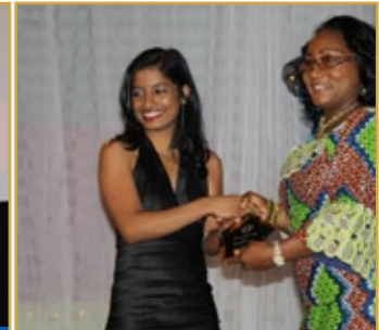
Baron Foods receiving Platinum award for Human Resource Development