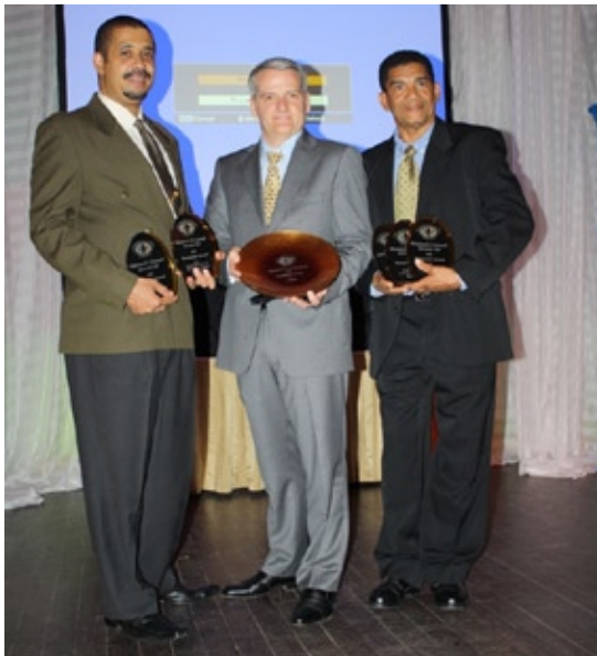
WLBL overall winners of SMA Quality Awards 2012

Two companies based in the south of the island have dominated the first-ever St. Lucia Manufacturers Association Quality Awards held on Saturday at Sandals Halcyon. The Windward and Leeward Brewery Ltd walked away with five Diamond awards plus the President's Award for the company scoring the most points in the programme. Baron Foods Ltd secured four Diamonds and One Platinum in addition to the Minister's Award for Innovation.