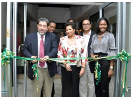
Prime Minister Gonsalves at opening of relocated branch of First Citizens branch in St. Vincent

First Citizens Investment Services has officially relocated its branch in St. Vincent and the Grenadines. The new office is now at Sprott Bros Plaza in Kingstown. The company commenced operations in St. Vincent in 2009. From humble beginnings in 2000 First Citizens Investment Services is now recognised as a leading innovator in the wider Caribbean financial marketplace.