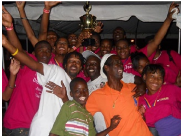
LIME Diamond Steel 2012 Junior Panorama Champions

The Caribbean's leading communications provider has joined steel band fans throughout Saint Lucia in extending warm congratulations to the winners of the 2012 Junior Panorama competition – LIME Diamond Steel.